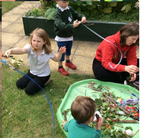
Making natural material sculptures.