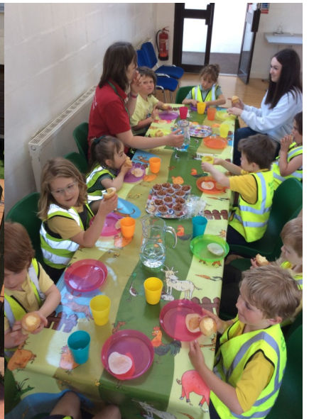
Our last visit to the village café this year. We made a card to say thank you.