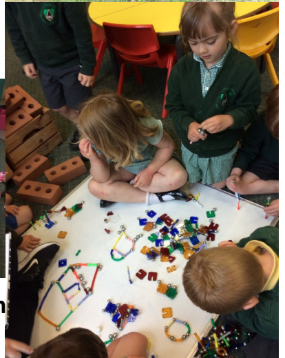
Building with Geomag