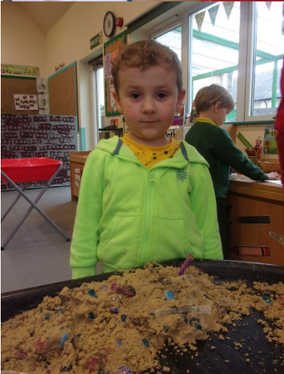
Role-playing hairdressers, sand play, junk modelling and building towers with magnetic shapes.